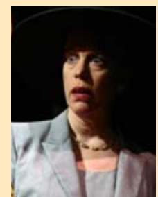
Z Space Studio 8th grade Word for Word