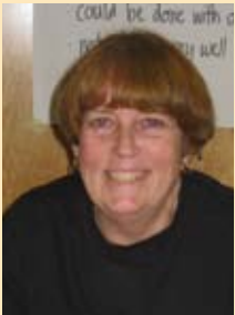
Gwen Perin Park, Strawberry Point Art